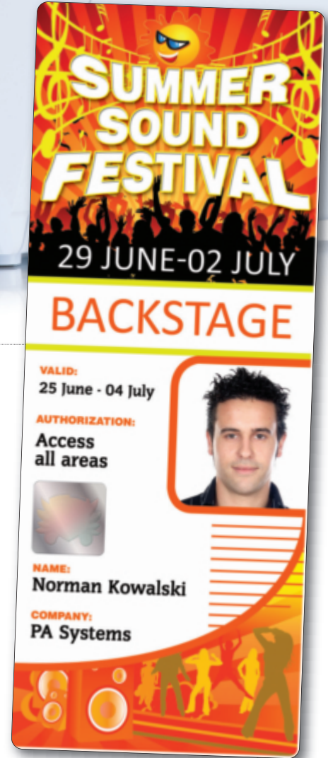
STANDARD CR80 CARD

Magicard's patented HoloKote® security technology adds a watermark to the card as it is printed - it requires no additional consumables and can be customized to an individual logo design - enabling true security at no extra cost.